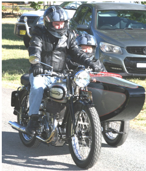
1940 Norton 16H Outfit