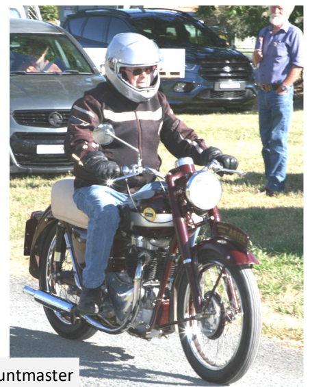
1954 Ariel Huntmaster