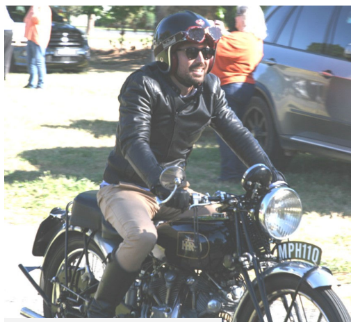
1947 Vincent HRD-1000