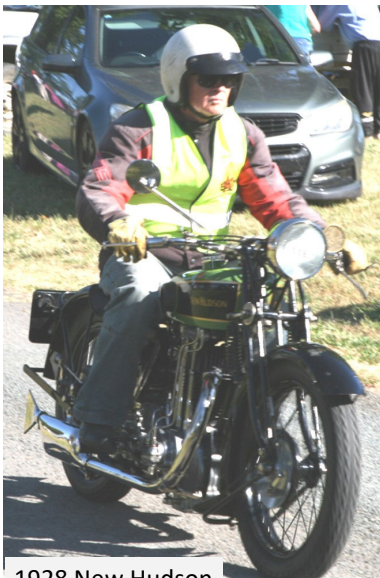
1928 New Hudson

The final leg completed the 135 kilometre trip back to Cootamundra through more quiet country roads with next to no traffic and we were expertly guided by the many corner marshals that kept everyone on track the entire journey. The backup trailers had a few hitch-hikers but nothing overly serious.