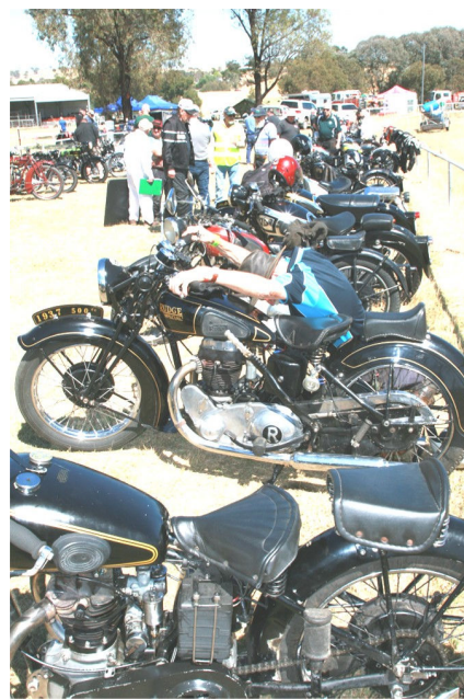
Morning Tea in Murrumburra