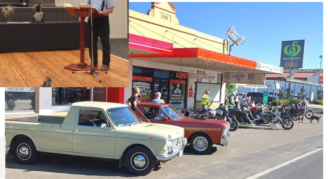
Gathering for the Run to Stockingbingal (Sunday morning)