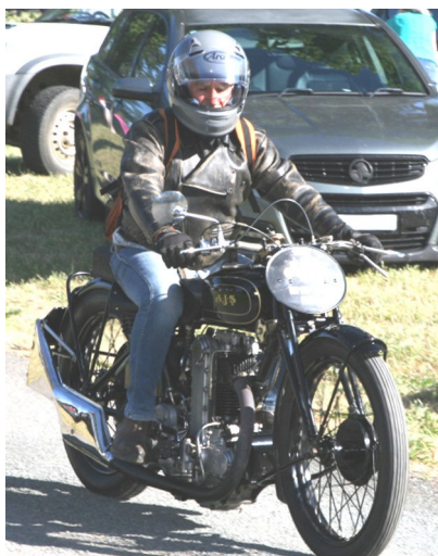
1930 AJ S M10 SR500