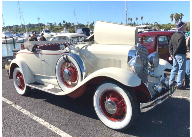
Also a 1950 Coupe highly modified by a local body builder.