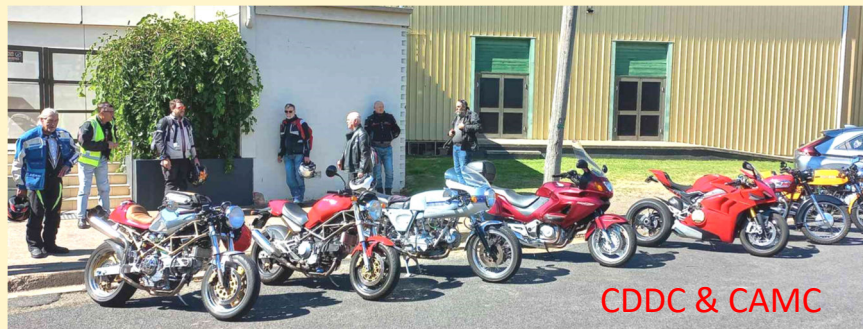
CDDC & CAMC