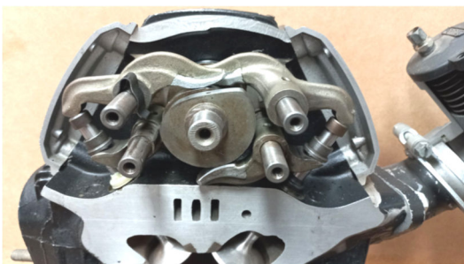
Thanks to Grant for providing this excellent picture of a 'Desmo' cylinder head