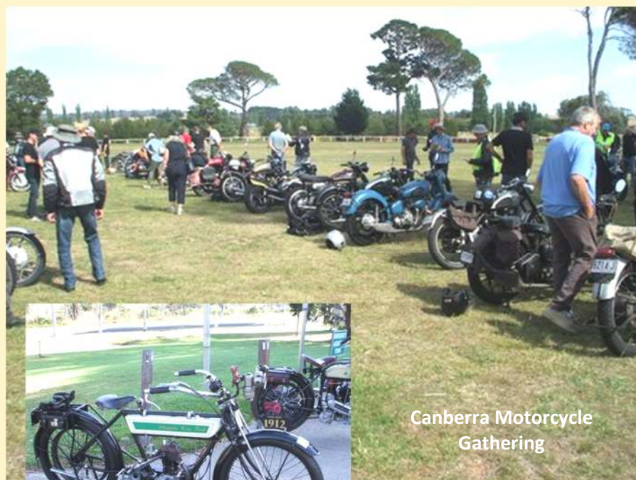
Canberra Motorcycle Gathering