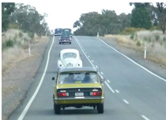
2021 Sunday Country Drive: