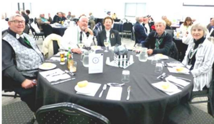
2021 Sunday Night Dinner: