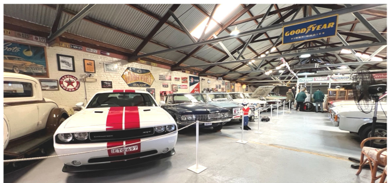
The Chrysler Museum - well worth a visit

After a filling lunch, we headed home on different back roads. As we drove out of town we diverted to check out the art work on the silos and take some photographs. The trip home was delightful and a great day was had by all.