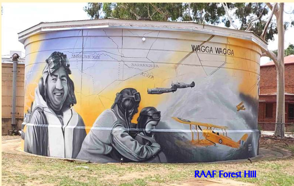
RAAF Forest Hill