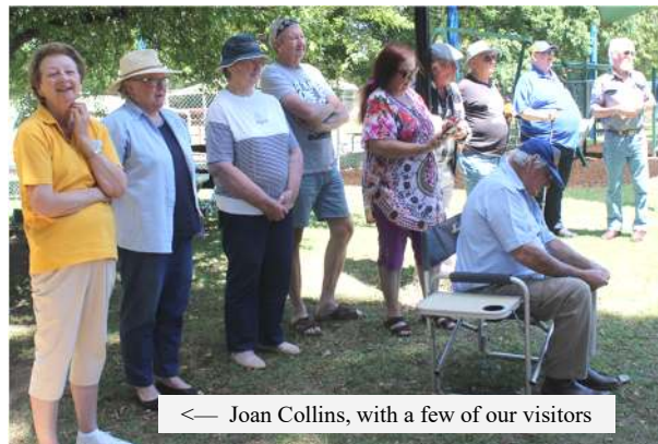
← Joan Collins, with a few of our visitors