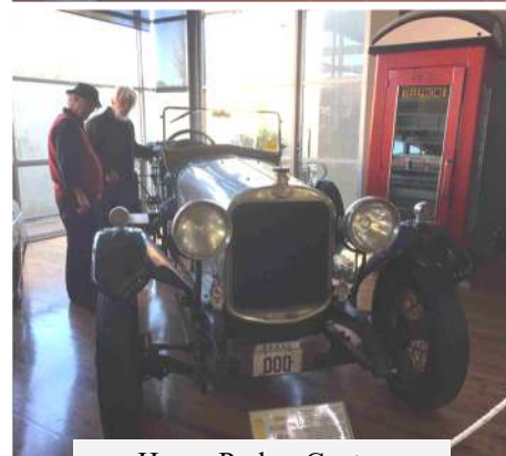
Henry Parkes Centre