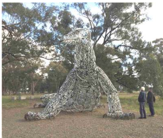
Goanna Sculpture - galvanized pipes (the totem of the Wiradjuri people)