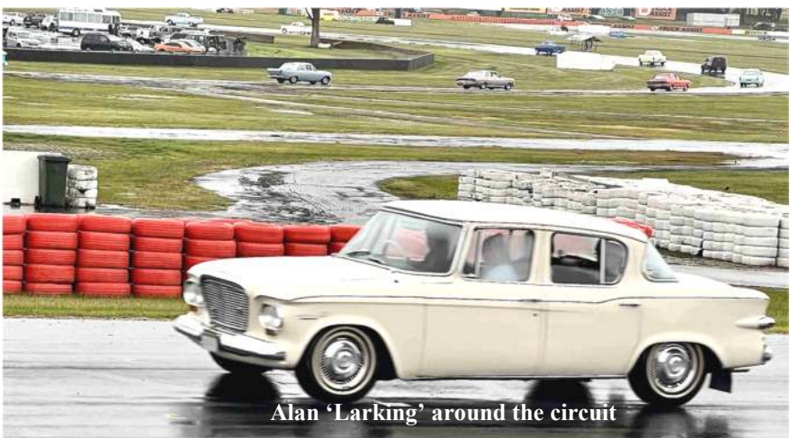
Alan 'Larking' around the circuit