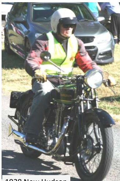
1928 New Hudson

The final leg completed the 135 kilometre trip back to Cootamundra through more quiet country roads with next to no traffic and we were expertly guided by the many corner marshals that kept everyone on track the entire journey. The backup trailers had a few hitch-hikers but nothing overly serious.