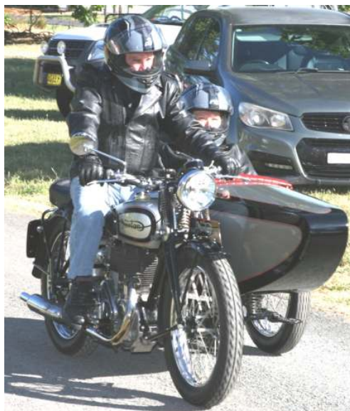
1940 Norton 16H Outfit