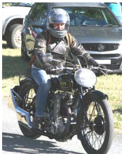
1930 AJ S M10 SR500