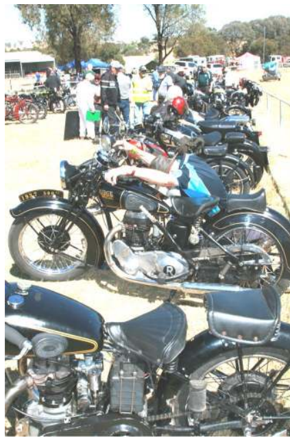
Morning Tea in Murrumburra