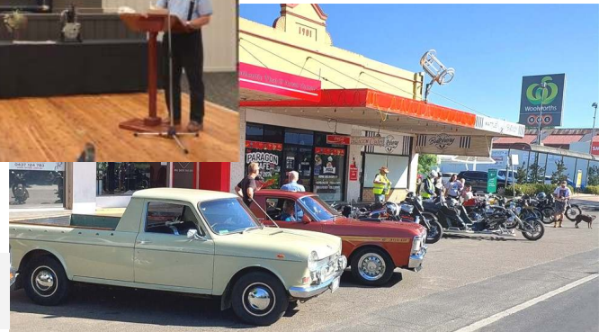
Gathering for the Run to Stockingbingal (Sunday morning)