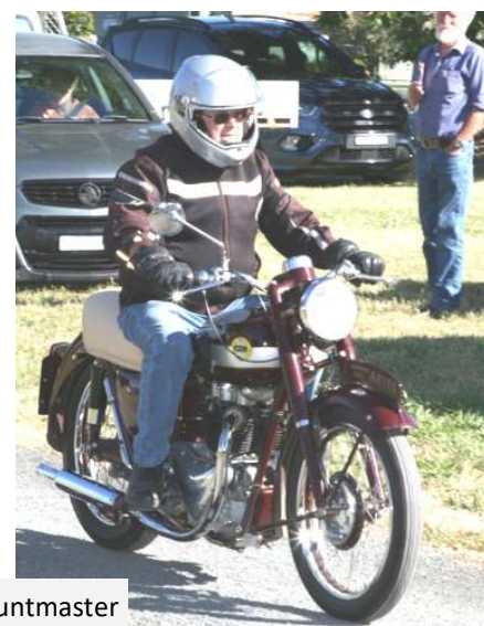
1954 Ariel Huntmaster