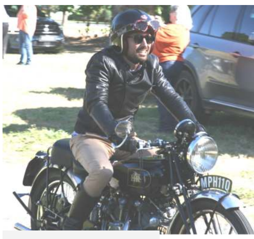
1947 Vincent HRD-1000